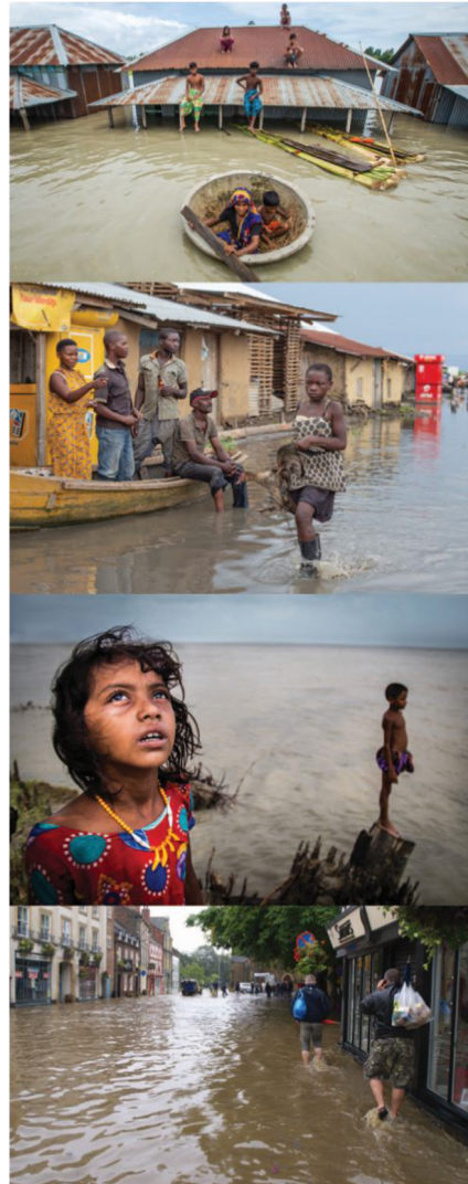
Figure 1. The impacts of climate-related droughts (left column) and floods (right column). Left column (top to bottom): “Children in dust storm” (Ethiopia, 2016; photograph: Anouk Delafortrie/EU/ECHO), a water hole that may have become empty because of drought (Mozambique, 2016; photograph: Aurélie Marrier d’Unienville/IFRC), drought-affected corn field in Paulding County, Ohio (United States, 2012; photograph: US Department of Agriculture/Christina Reed), “Drought in Kenya’s Ewaso Ngiro river basin” (Kenya, 2017; photograph: Denis Onyodi/Denis Onyodi/KRCS). Right column (top to bottom): houses are nearly submerged by flooding (Bangladesh, 2020; photograph: Moniruzzaman Sazal/Climate Visuals Countdown), “A girl, duck in hand wades through the water in Rwangara” (Uganda, 2020; photograph: Climate Centre), “two children a boy and a girl on a flooded riverbank” (Bangladesh, 2018; photograph: Moniruzzaman Sazal/Climate Visuals Countdown), “Residents wade through flooded streets to escape flood waters” (United Kingdom, 2008; John Dal). All photos are licensed under Creative Commons and all quotes are from the Climate Visuals project ( https://climatevisuals.org ). See supplemental file S1 for details and more pictures.

especially in low-income areas that are most vulnerable to climate impacts. More generally, other policy instruments could include investments in innovation and climate finance (supplemental figure S5), positive subsidies, and feed-in tariffs that guarantee an above-market price for renewable energy producers.