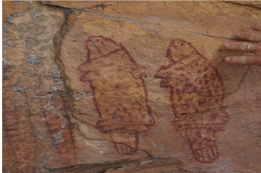
Rifle fish (Archer fish), totemic animal of Rifle Fish Clan