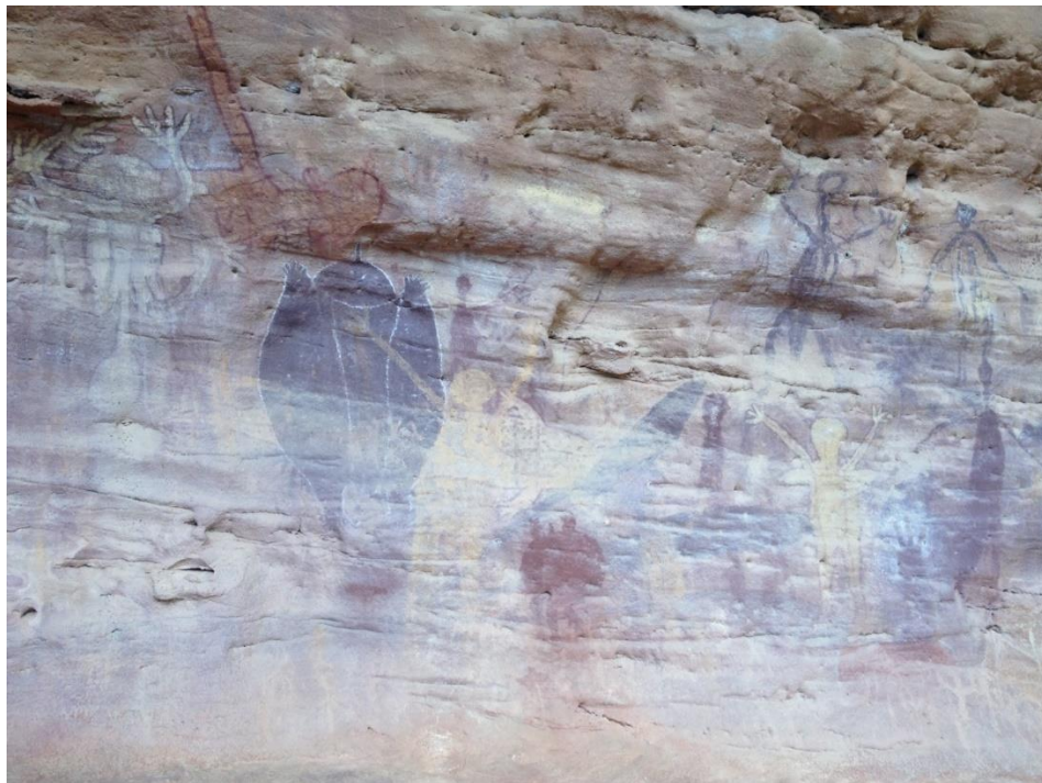
Spirit figures (Quinkans). Bent arms and knobbed penis on the white figure on left suggests it has a spiteful nature. Dark figure to its right represents an echidna (spiny anteater), an egg-laying mammal related to the platypus.

The Quinkan area is currently under consideration for World Heritage status and that is one major step forward. However, the practical maintenance of the art remains an issue. One question is whether rock art should be touched up as it fades. Redefining paintings is not unusual in areas where the original clans are still living and the stories portrayed in the art are still well known. This is the case with the world famous Lightning Man painting at Nourlangie which was last repainted in 1964 by Nayombolmi, a respected artist of the Badmardi clan. Problems arise where the original people have been displaced or the knowledge relating to the rock art has been lost. An ironic twist to the situation is that some visitors are disappointed if they find that paintings have been recently renewed and thus not untouched since the original work done millennia ago. This ignores that rock painting is a living process, so that some pictures are refreshed to retain the original information and others may be wholly or partially painted over in accordance with developments in the local Aboriginal culture.